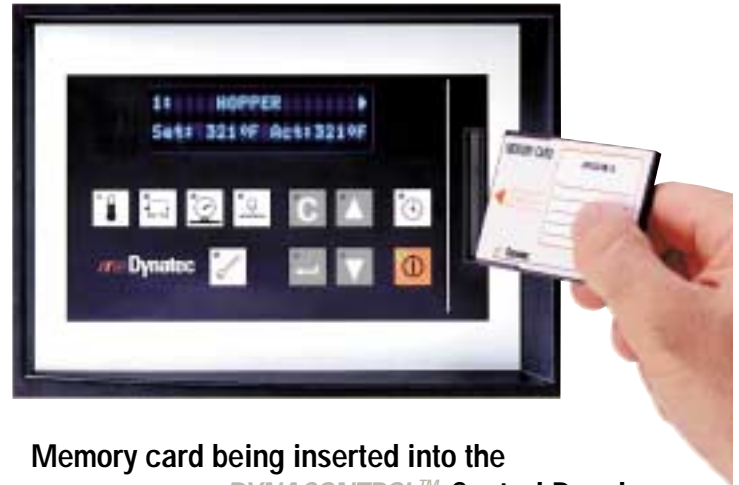
Memory card being inserted into the DYNACONTROL™ Control Panel