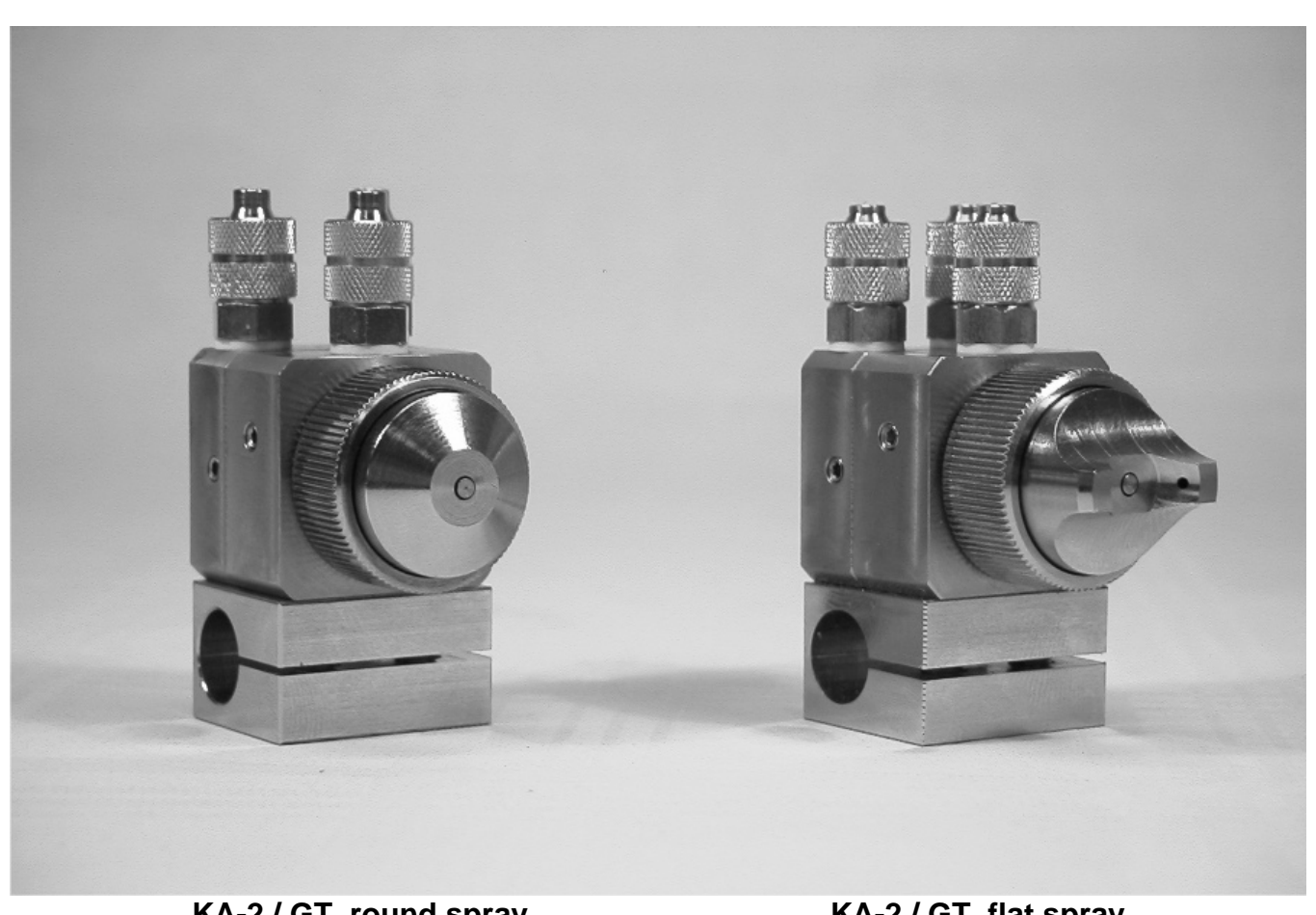
KA-2 / GT, round spray with clamp (option)